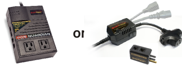
POS Guardian / Smart Cord And Optional SmartNet II