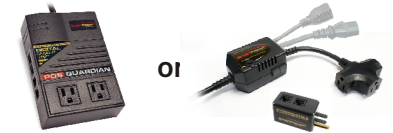
POS Guardian / Smart Cord And Optional SmartNet II

SmartNet II Network Protection & or Smart Cord Power Filtration for Remote IP Printer