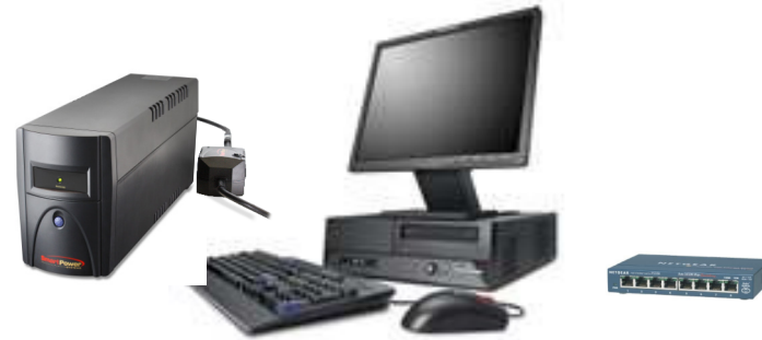
Back Office Server Setup