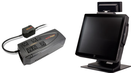
Station 1 / Back Up Server